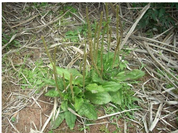
Figure 1. P. australis Vegetal Species